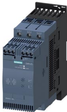
SIRIUS soft starter S2 45 A, 22 kW/400 V, 40 °C 200-480 V AC, 110-230 V AC/DC Screw terminals